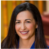
Dori Yob Kilmer Litigation - Land Use and Zoning / Litigation - Real Estate